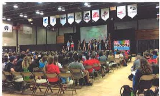
Conference attendees look on as trained youth staff perform drug prevention skits.