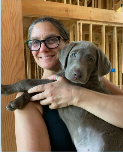
Counselor A - D