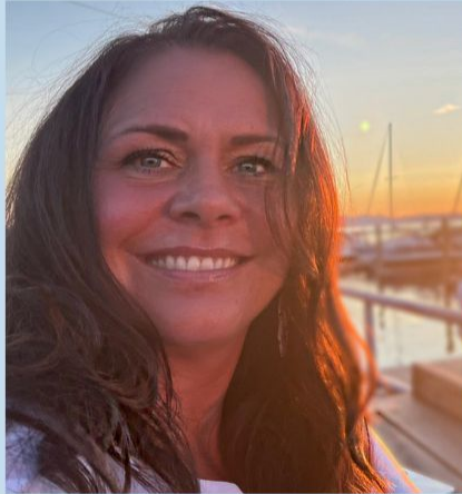
Counselor E - K