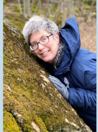
Coordinator Flexible Pathways