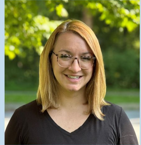
Counselor L - R