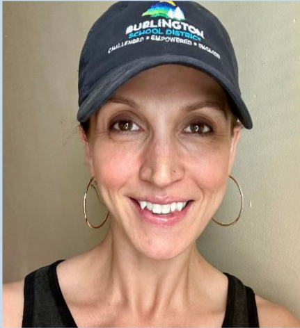
Counselor S - T