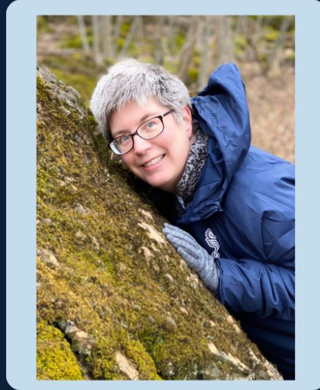
Flexible Pathways Coordinator