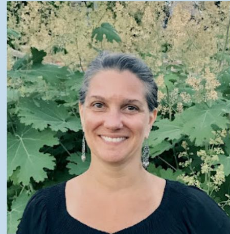
Counselor A - D