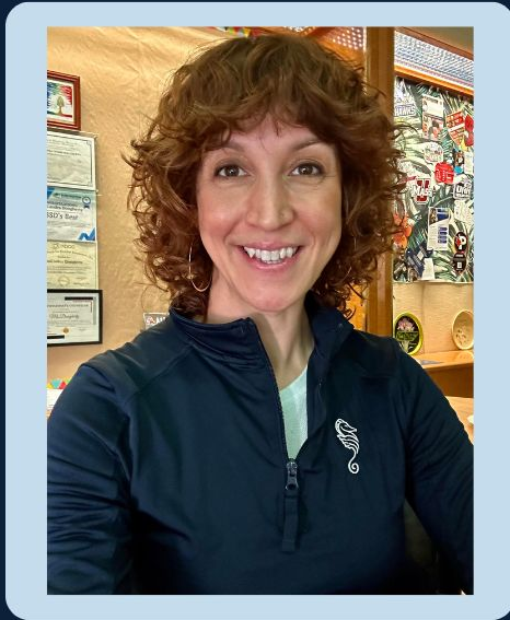
Counselor S - T