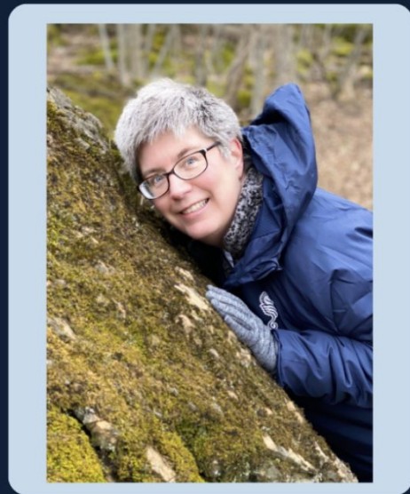
Flexible Pathways Coordinator